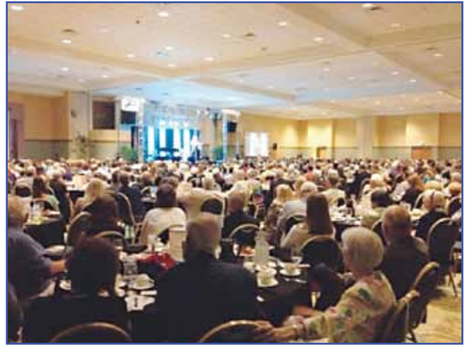
Full house at our Annual Banquet on September 20!

A night of dinner, dancing and Dads and Daughters challenging the cultural norm by committing to foster a lifestyle of purity!